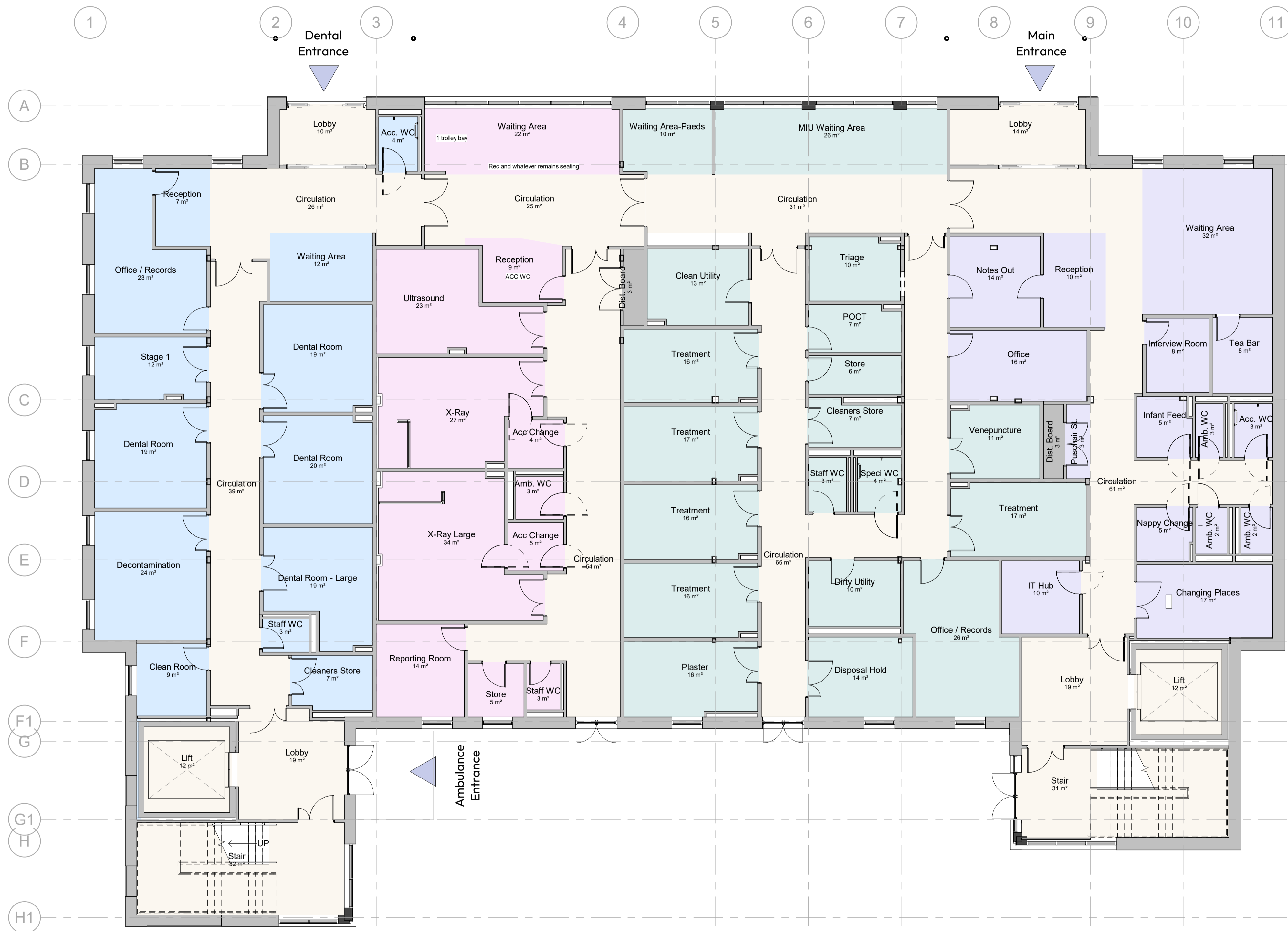
Level 00 - Proposed 1:100